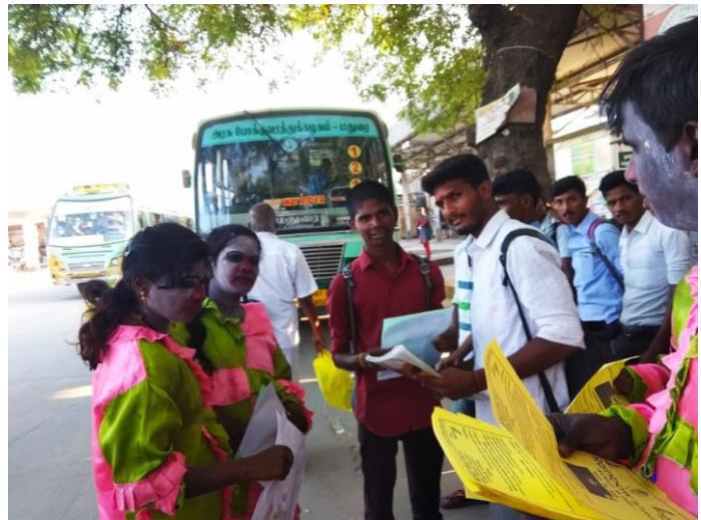
Handing out fliers with TB information on the street

1. Rainbow TB Forum received funding from Cepheid for a two days TB awareness raising event in the weekend of World TB Day 2019. Rainbow TB Forum, together with Blossom Trust, shared the stories of TB survivors across Virudhunagar, raised awareness about TB symptoms by handing out fliers with a TB disease profile, and collected 1,629 signatures for a government petition to include TB rights on political candidates' platforms.