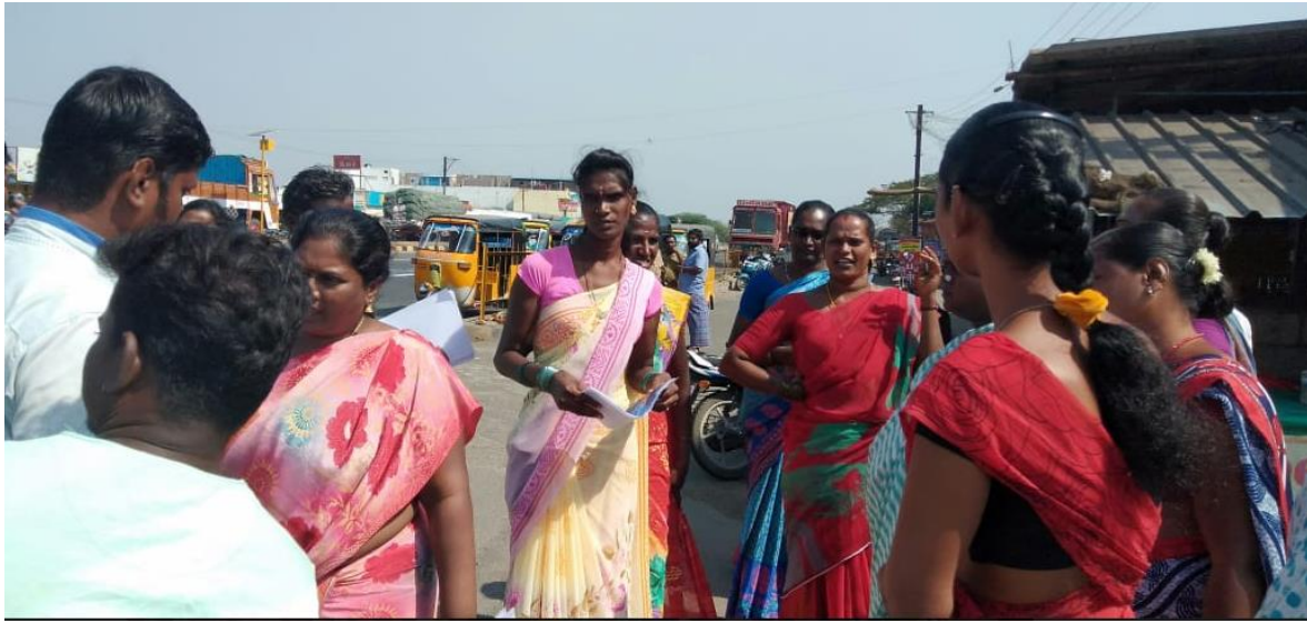
Hotspot meeting for raising awareness in the community