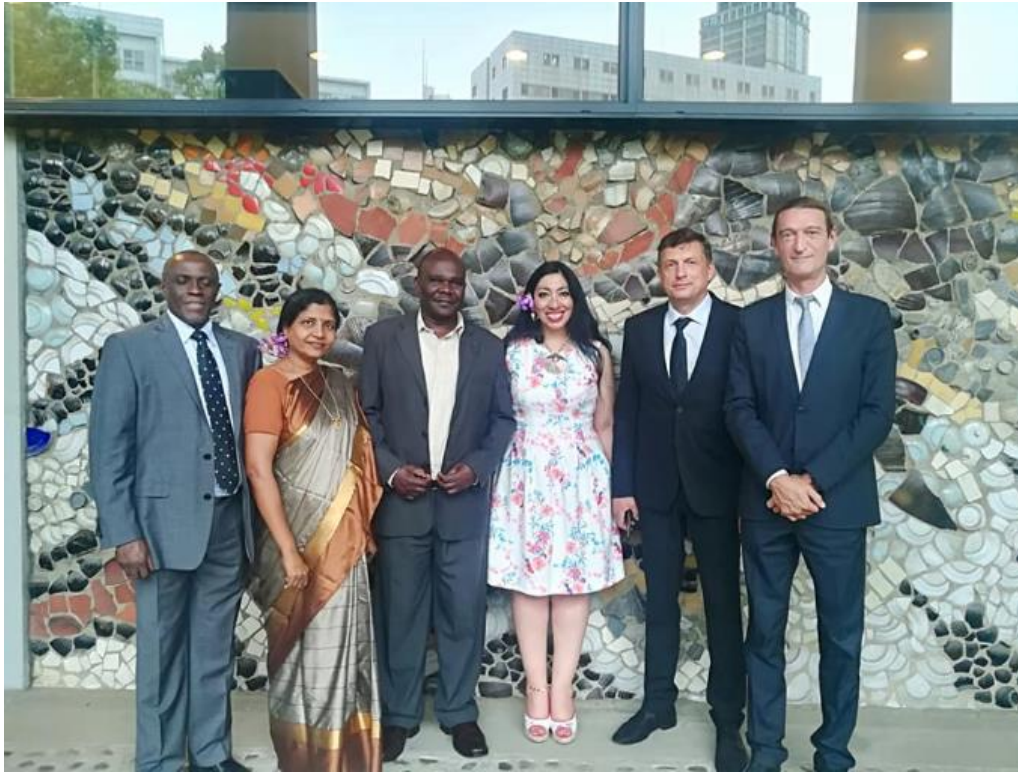
32nd Executive board meeting in Seoul, South-Korea

delegation is to vote for how funding of large donors is divided between several health issues. As representative of the TB community in India, our director uses her position to push for TB funding for Asian countries.