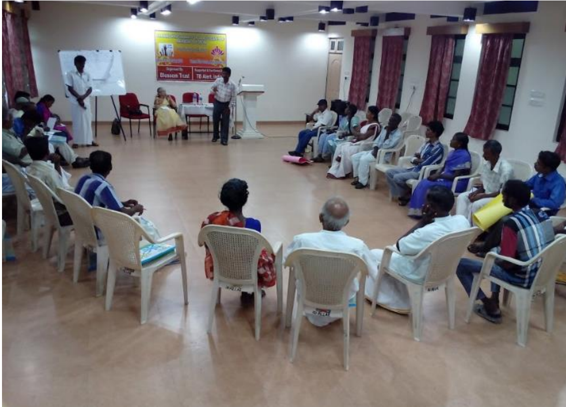
Rainbow TB Forum advocacy meeting

Since her inception in 1993, Blossom Trust has been empowering women and TB patients, leading to diverse community based organisations (CBOs) who are now largely independently running, but still overseen by Blossom Trust.