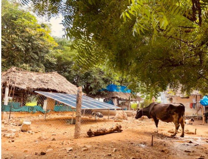
Solar panels at the farm